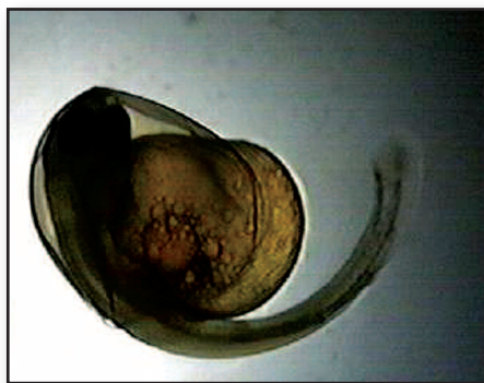
Student raise trout from eggs . . .

Trout are indicator species; their abundance directly reflects the quality of the water in which they live. In the TIC program, students grow to care about their trout and then the habitat in which trout live. As the program progresses, students learn to see connections between the trout, water resources, the environment, and themselves.