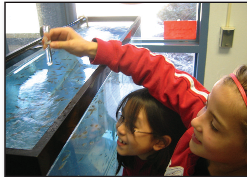
. . . study and care for them all year . . .

Many different TIC programs already take place throughout the country, from California and the Pacific Northwest to New England and Mid-Atlantic states.